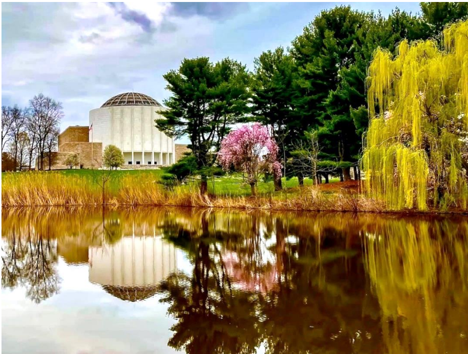
Springtime at Founders Hall on the grounds of the Milton Hershey School