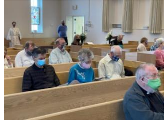
Redeemers and Guest on Call Sunday, April 11, 2021