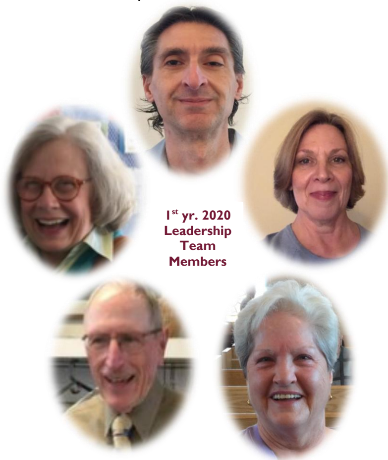
1 st yr. 2020 Leadership Team Members

Beginning next month, we'll feature brief articles about each of our new Leadership Team members. Stay tuned! You may learn something new about each of them that you never knew! They will be installed on Feb. 9.