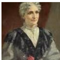
Mary Baker Eddy

Wikipedia says First Church of Christ, Scientist was incorporated by Mary Baker Eddy in 1879 in Boston after her claimed 1866 physical healing that she attributed to reading the Bible. (It is not related, nor has it ever been, to The Church of Scientology)